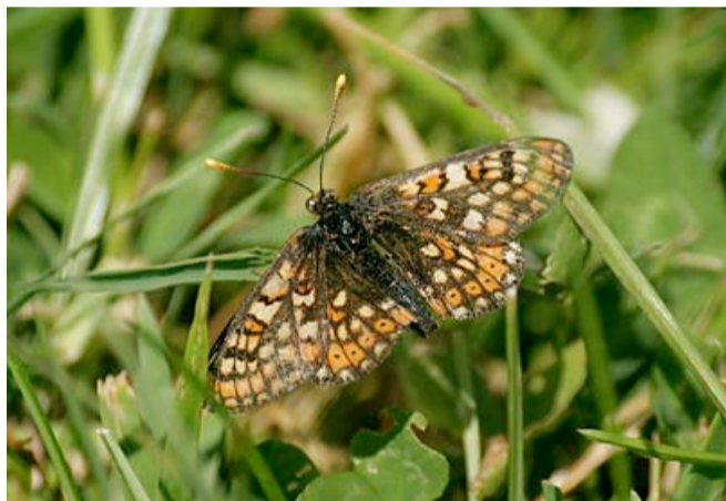
Right: A male Marsh Fritillary

We visited this superb site to see the colony of Marsh Fritillaries and weren't disappointed with perhaps as many as 20 of these beautiful insects, although they were all rather tatty. All sorts of other insects were seen including a Burnet Companion, a Garden Chafer, a Dung Beetle and, less welcome, quite a few Horse-flies.