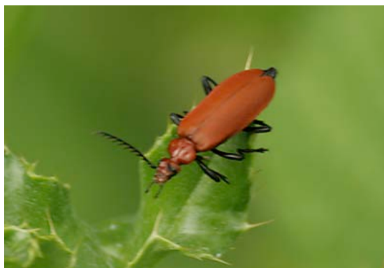
Red-headed Cardinal Beetle