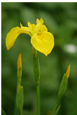
Yellow Flag Iris