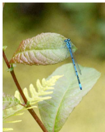
Azure Damselfly