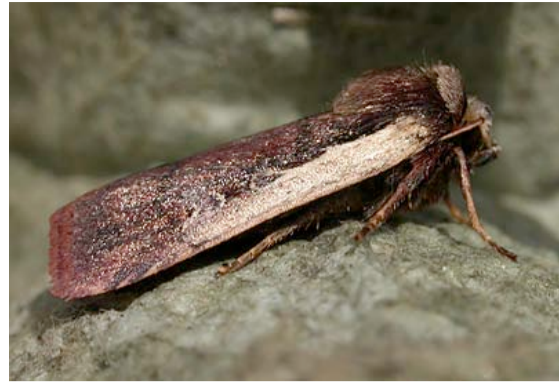
Right: Flame Shoulder